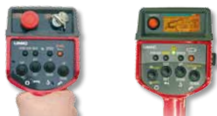
Standard radio remote control